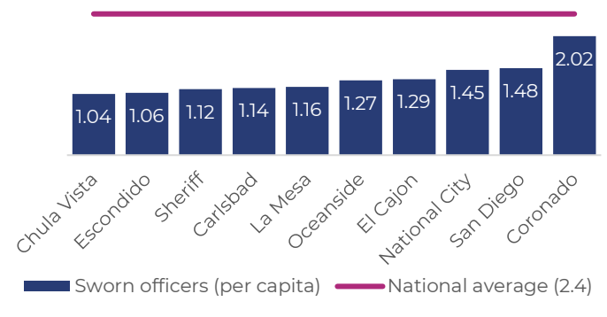
Figure 3: Per capita sworn officers by jurisdiction (FY 2022-23)