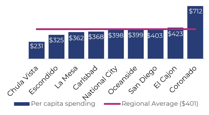
Figure 2: Per capita law enforcement spending by jurisdiction (FY 2022-23)