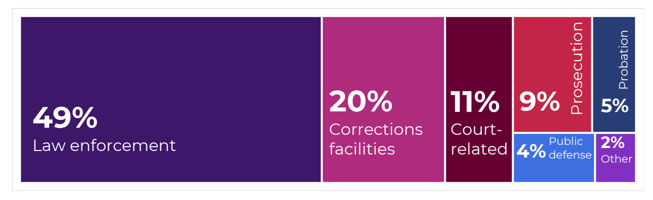
Figure 1: Allocations of public safety expenditures (FY 2022-23)